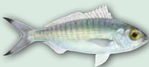
Australian herring ( Arripis georgianus )