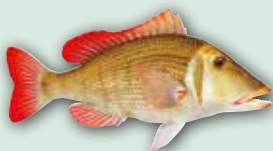
Redthroat emperor ( Lethrinus miniatus )