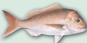
Snapper ( Pagrus auratus )