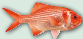
Bight redfish ( Centroberyx gerrardi )