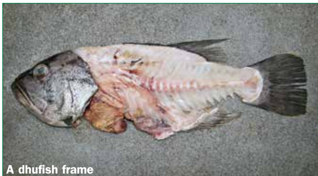
A dhufish frame

Hand your fresh or frozen fish frames (with the heads and guts intact) to any of the drop-off locations listed on the next page. You can keep the fish's wings (pectoral fins) and cheeks if you like.