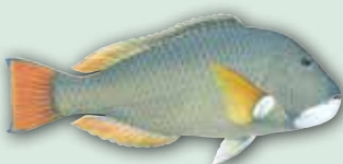
Baldchin groper ( Choerodon rubescens )