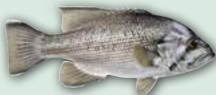
West Australian dhufish ( Glaucosoma hebraicum )